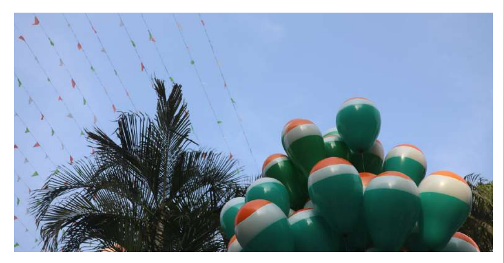
January Reflections: Inspiring Adventures, Enlightening Conversations, and Joyful Gatherings in Atharva's 70th Chronicle

Welcome to this January 2024 edition of Atharva, where we bring you insightful articles on various topics of interest.