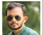
Shubham Sonawane Photographer