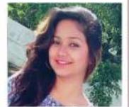
Richa Rani Photographer