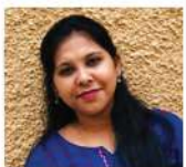
Seema Pagare Photographer