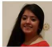
Harsimran Kaur Bhogal Photographer