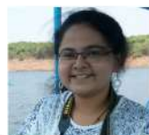
Veeralakshmi Aradhni Photographer