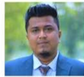
Sagnik Das Photographer