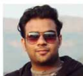
Siddharth Saxena Photographer