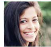
Arushi Khapekar Photographer