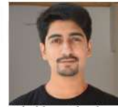
Shubham Chauhan Video Editing