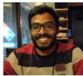
Anand Malla Photographer